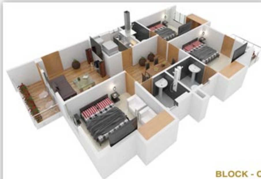
BLOCK - C

Architecture brilliance achieved through 'No Common Wall Concept' which gives you 'Home not just House' Design which is futuristic, all side open homes, keeping the flow of light and air on the highest level and maximum privacy