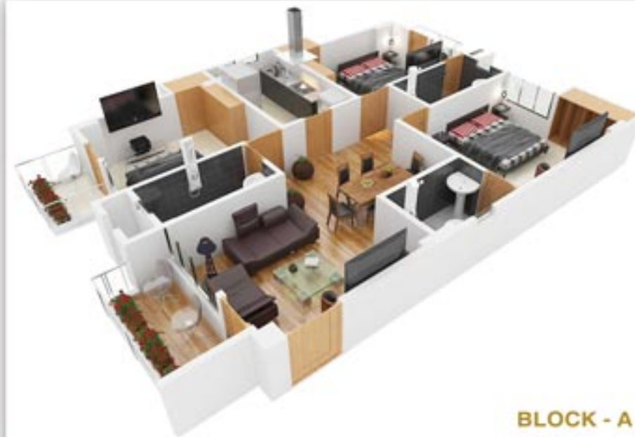
BLOCK - A