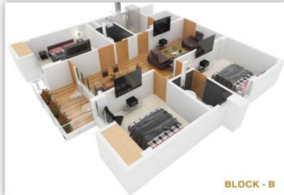
BLOCK - B